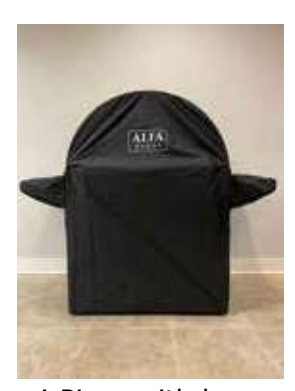
4 Pizze with base cover