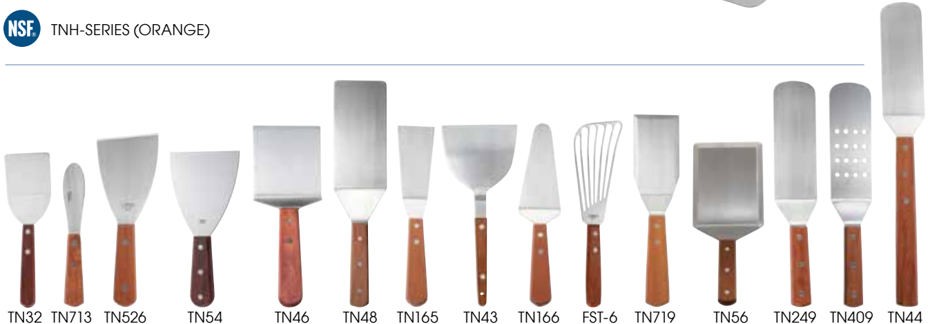
TN32 TN713 TN526 TN54 TN46 TN48 TN165 TN43 TN166 FST-6 TN719 TN56 TN249 TN409 TN44