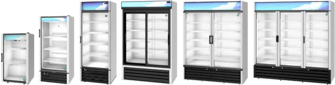
RM-7-HC RM-10-HC ENERGY STAR Qualified RM-26-HC ENERGY STAR Qualified RM-45-SD-HC (Sliding doors) RM-49-HC RM-65-HC