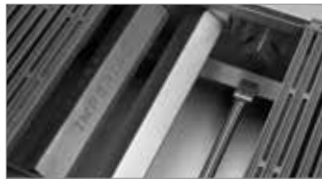
Stainless steel burner shown with both styles of radiants: cast iron and stainless steel.