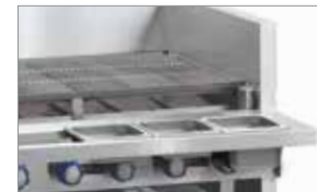
Optional stainless steel, 9¾" (248) deep work deck with a full width cut-out for sauce pans.