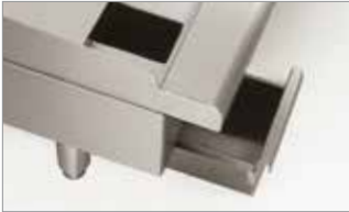
4" (102) wide grease gutter and 1 gal. (3.8 L) grease can