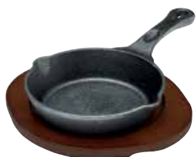
CAST-6 with CAST-6UL