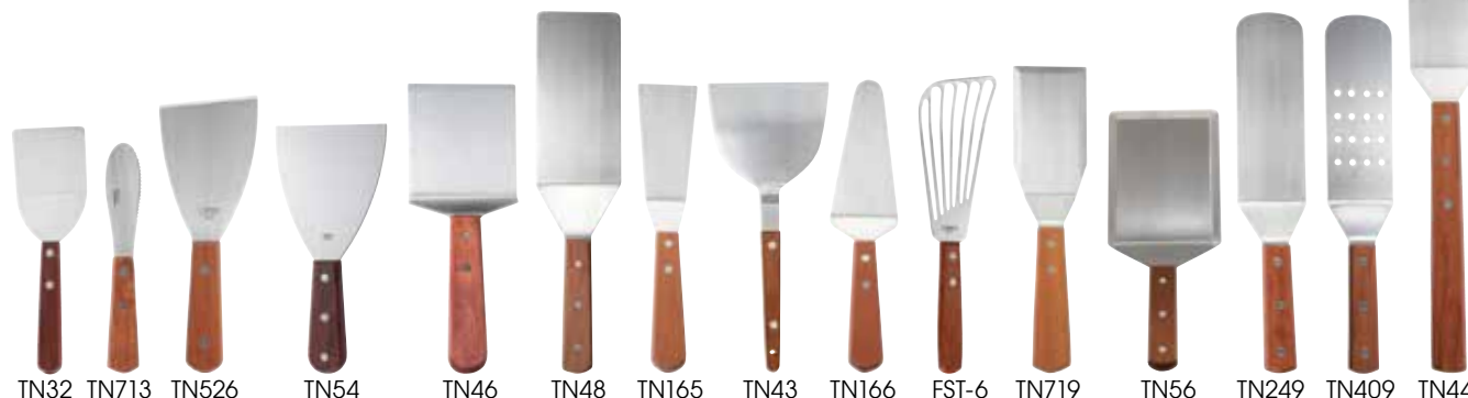
TN32 TN713 TN526 TN54 TN46 TN48 TN165 TN43 TN166 FST-6 TN719 TN56 TN249 TN409 TN44